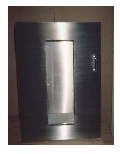
Cart passer sized Package Receiver as viewed from the protected side.