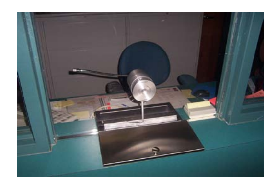
Flip Top Cash Tray

Many custom cash tray devices are possible, such as flip top trays for frequent use where exterior exposure to drafts and temperature is not desireable.