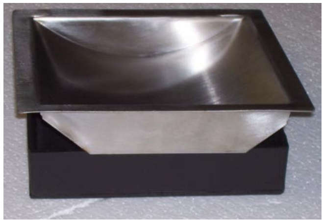
Tray shown with optional bullet trap

Standard Drop In Deal Trays are made of a heavy gauge stainless steel with a brushed finish designed to withstand years of exposure while resisting nicks and scratches. The dish section measures 1-1/2" deep with a 1/2" wide perimeter lip all around. Available in any width, this tray makes an excellent choice for ticket booths, service stations and other locations where smaller items are passed. Installation is as simple as cutting a rectangular opening in the counter top, and dropping in the tray that meets your needs. Deal Tray does not have drain holes, so an awning or overhang is recommended when used in an exterior application. Standard sizes range from 8" to 18", and custom sizes are also available.