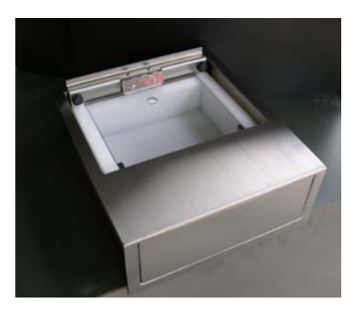
Top View w/Drawer Closed

Transaction Drawers are available in two different configurations; one designed to be installed into a counter, one designed to allow thru-wall installation. Simply choose the drawer that accommodates your installation requirements. Suitable for drive-up and walk up service, this weather resistant drawer has a Lexan lid to allow clear view of contents while preventing direct entry of outside air. Stainless steel front panel pivots up as drawer is extended. Push button latch keeps drawer lid locked when closed.