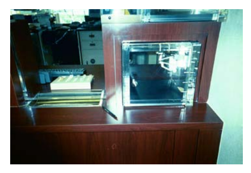
Passer in Hood

Class 1, 2, or 3 bullet resistant protection. Standard exterior dimensions: 14" wide x 14" high x 14" deep. Other sizes available on request.