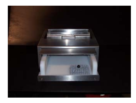
Front View w/Drawer Open