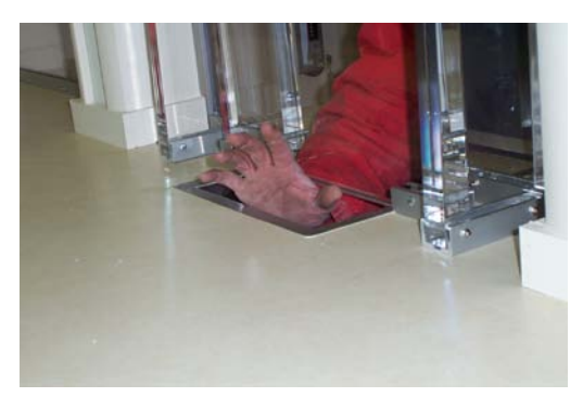
Over sized Cash Tray