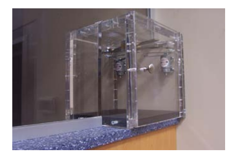
Passer Against Wall