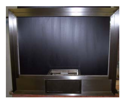
Drawer w/Window Assembly