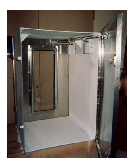
Inside view of cart passer sized Package Receiver.

Vision Panel: Class 1, 2, or 3 in Acrylic or GCP.